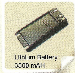
Lithium Battery 3500 mAH