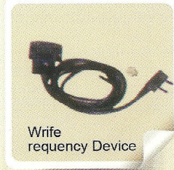
Write frequency Device